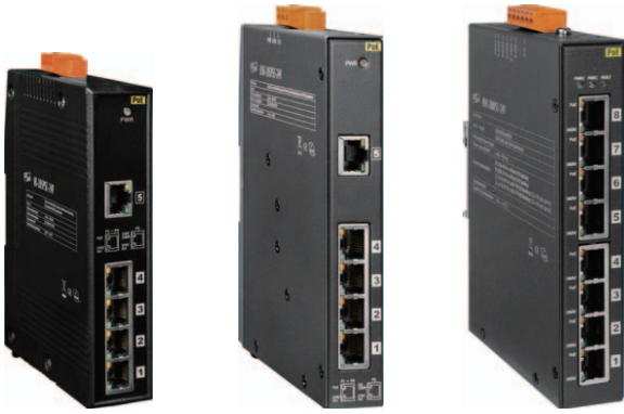
NS-205PSE-24V NSM-205PSE-24V NSM-208PSE-24V

5(8)-port 10/100 Mbps PoE (PSE) Ethernet Switch with +24 VDC Input